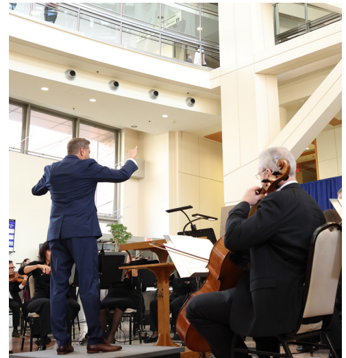
The National Symphony Orchestra performs in the Clinical Center atrium in September 2023.

The Music in the Atrium series is a long-cherished tradition at the NIH Clinical Center, offering a welcome respite to patients, visitors and staff. The program is open to local musicians who would like to share their performances of classical, jazz, bluegrass or other music.